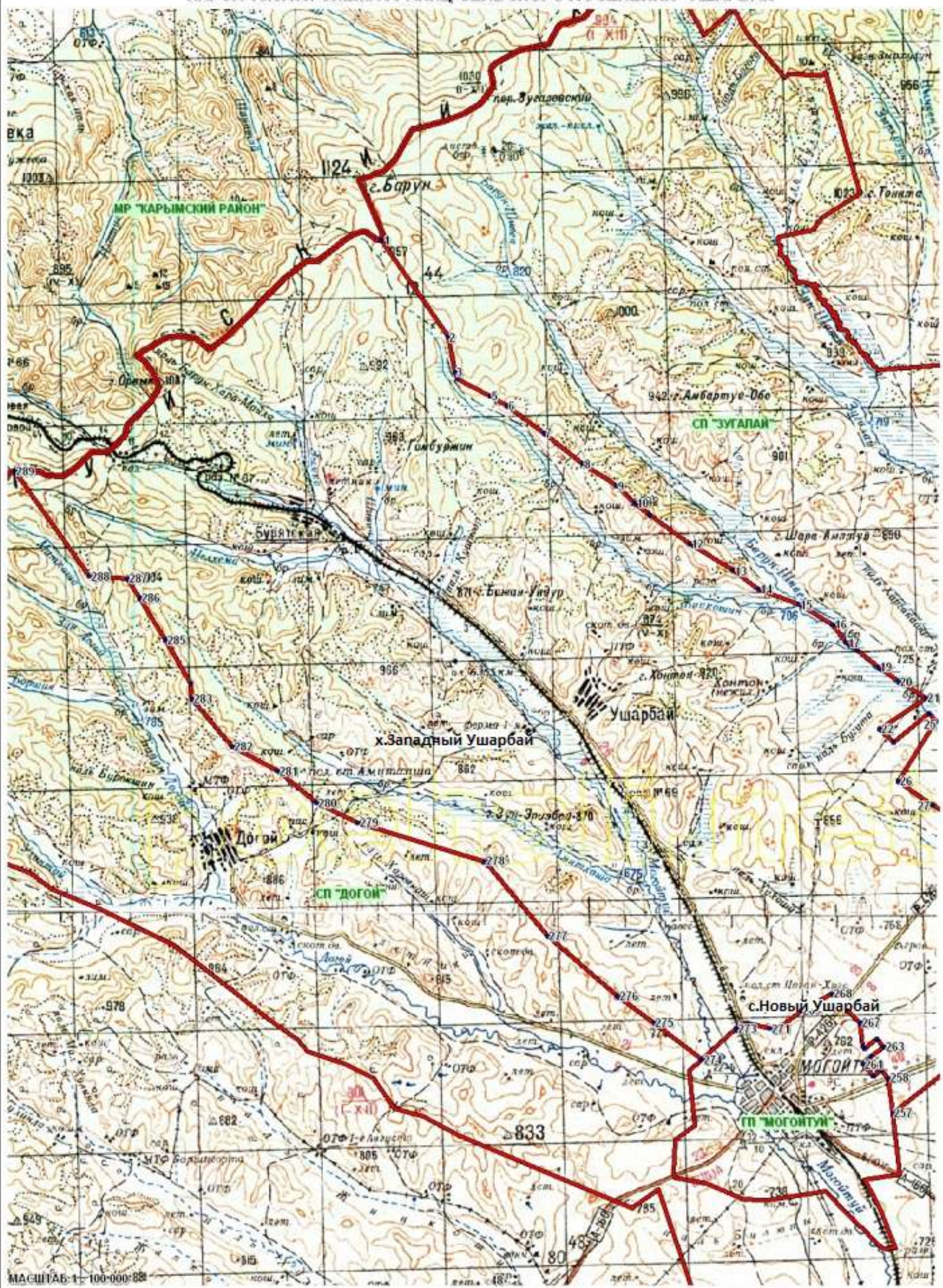
КАРТА 15.9.1.1. СХЕМА ГРАНИЦ СЕЛЬСКОГО ПОСЕЛЕНИЯ "УШАРБАЙ"